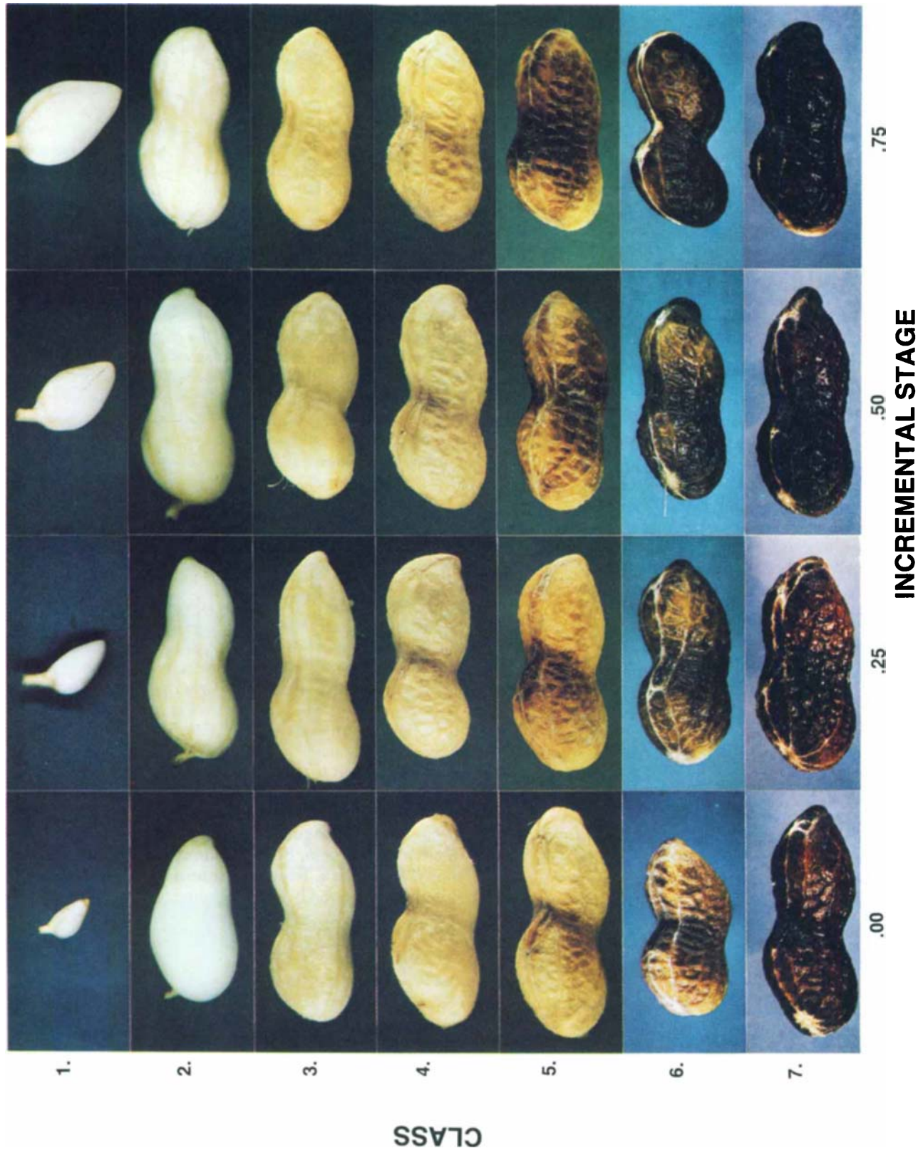
Fig. 2. Flurunner mesocarps (exocarp removed) of seven maturity classes subdivided into incremental stages.