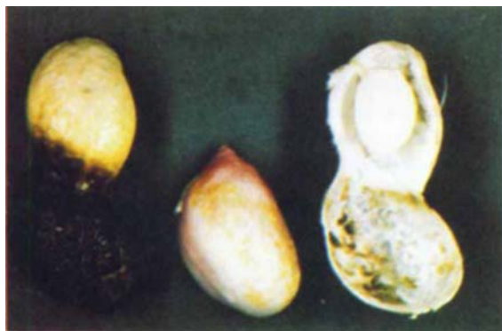
Fig. 4. Mesocarp, inner pericarp, and seed of pod with severe lag in apical segment development.