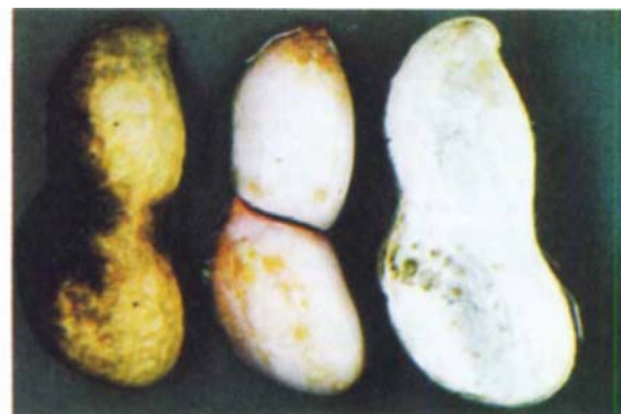
Fig. 5. Mesocarp, inner pericarp, and seed of pod subjected to soil moisture deficiency.