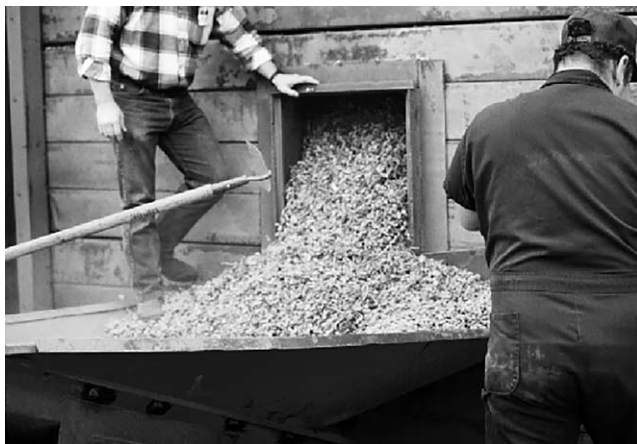
Fig. 2. Peanuts flowing from the drawport of a farmers' stock warehouse.

Blankenship and Lamb (1996) compared the mechanical damage to peanuts using conventional loading and unloading equipment to using potato handling equipment. The potato handling equipment basically consists of several sections of belt conveyor with the final section being able to elevate and steer to place the product where necessary. A flat conveyor section that lies on the floor beneath the truck hopper was used to empty the truck and load the warehouse. When unloading the warehouse, a steerable scoop drives to the edge of the pile and the belt extends into the pile (Fig 4). Peanuts flow onto the belt and into the waiting truck. Their analysis showed that the potato handling equipment reduced LSK by 1.8% and sound splits by 4% compared to a conventional bucket loader. When using the potato handling equipment to load a warehouse, the depth of the