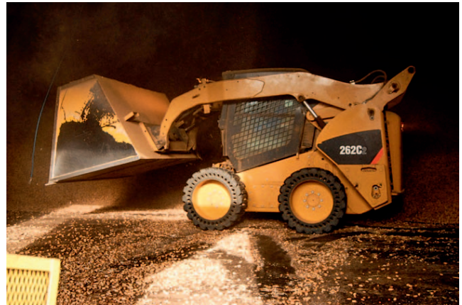
Fig. 3. Skid-steer loader emptying farmers' stock peanuts into bin for transfer onto a waiting truck for transport to the shelling plant.

pile is limited by the vertical reach of the conveyor and is usually no more than 7 m.