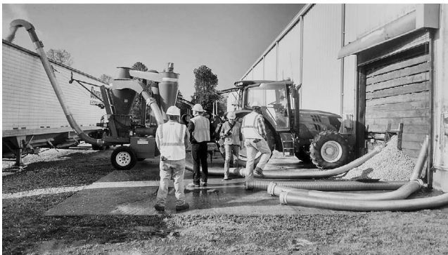
Fig. 7. Peanut vac in use to unload farmers' stock peanuts from the warehouse into the truck during testing to compare capacity and mechanical damage with conventional warehouse unloading systems.

At the second location, an articulated front-end loader was used to load trucks. Again, the equipment was positioned so that both the bucket loader and the peanut vac could be used simultaneously. Trucks loaded by the articulated bucket loader had more FM (5.3%) and LSK (7.5%) than those loaded with the peanut vac (2.4 and 4.3%, respectively). The moisture content of the peanuts was similar because both loaders were extracting peanuts from the interior of the warehouse. The