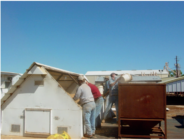
Fig. 5. Manually unloading farmers' stock peanuts from the 1/10-scale warehouses.

falls from a holding tank through an airlock into a flowing airstream and conveyed to its destination. In a negative pressure, or pull-type, conveying system both the air and grain are pulled toward the intake of a fan/blower into a cyclone to separate the grain before it flows through the blower. The third type is a combination unit where grain is picked up and conveyed to the cyclone where it is dropped out and back into the flowing air stream from the same blower. Pneumatic systems are used in farmers' stock cleaning systems and the shelling plant to aspirate and convey light trash, dirt, and hulls from the shelling process (Davidson et al. 1982). Portable grain vacuums have been used on farmers' stock peanuts only in very limited situations such as final clean-up of a warehouse or spillage following an overturned trailer.