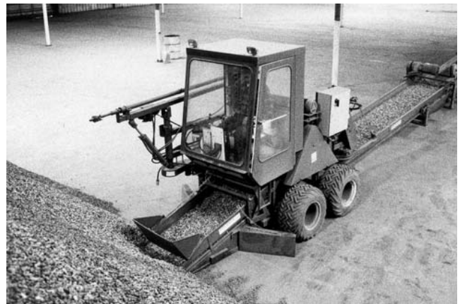
Fig. 4. Potato handling equipment used to unload farmers' stock peanuts from flat storage.

Pneumatic conveying systems are used frequently in commercial grain handling facilities, barges, and on-farm storage (Loewer et al. 1994). Pneumatic conveying systems are of three general types. In a positive pressure (push) conveying system, air is forced through a pipe by a blower and the grain