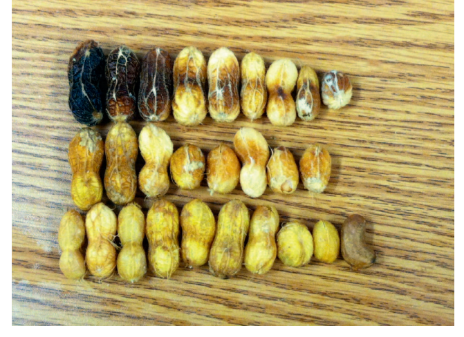
Fig. 3. Illustration of how peanut pods were separated into the mature brown/black class (top row), orange or brown pods classified as mature (middle row) and the immature yellow (bottom row) class for this study. The middle row was categorized as mature for data processing purposes. Photograph by Ethan Carter .

Maturity Separation by Stage . At the FIELD stage with all four cultivars represented, there were differences among cultivars (P Value < 0.0001),