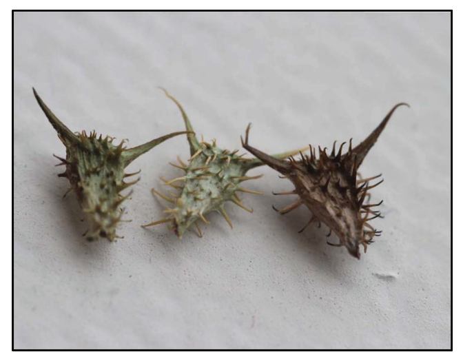
Figure 1. Bristly starbur ( Acanthospermum hispidum ) seed from Georgia.

Bristly starbur is a C<sub>3</sub> plant native to tropical America, introduced to the US in the 1800's and is now distributed in over 40 countries. The Latin binomial, Acanthospermum hispidum DC, is descriptive of the plant; Akanthos is Greek for spine, thorn, or prickle, sperma means seed, and hispidum is Latin for bristly or rough (Holm et al., 1997). The achene (also called a bur) is approximately 6 mm long, with stiff hooked spines, and two long spines at the apex (Figure 1). Seed are moved by clinging to equipment and animals, and both the vegetative parts of the plants and seed are poisonous to consume. In addition, the seed and plants are reported to contain allelochemicals (various phenolic acids) (Holm et al. 1997). Bristly starbur control is essential to prevent proliferation to other fields via contaminated harvesting equipment, peanut hay, and peanut seed given this species unique adapted ability to cling too many different surfaces. In 2009 and 2013 bristly starbur was the 6<sup>th</sup> and 10<sup>th</sup> most common and troublesome weed, respectively in Florida peanut and the 8<sup>th</sup> most common weed in Georgia peanut (Webster, 2009; 2013).