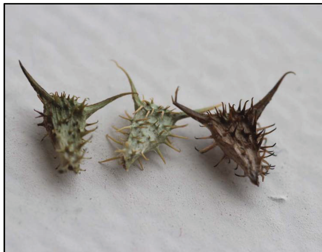
Figure 1. Bristly starbur ( Acanthospermum hispidum ) seed from Georgia.

Bristly starbur is a C 3 plant native to tropical America, introduced to the US in the 1800's and is now distributed in over 40 countries. The Latin binomial, Acanthospermum hispidum DC, is descriptive of the plant; Akanthos is Greek for spine, thorn, or prickle, sperma means seed, and hispidum is Latin for bristly or rough (Holm et al. , 1997). The achene (also called a bur) is approximately 6 mm long, with stiff hooked spines, and two long spines at the apex (Figure 1). Seed are moved by clinging to equipment and animals, and both the vegetative parts of the plants and seed are poisonous to consume. In addition, the seed and plants are reported to contain allelochemicals (various phenolic acids) (Holm et al. 1997). Bristly starbur control is essential to prevent proliferation to other fields via contaminated harvesting equipment, peanut hay, and peanut seed given this species unique adapted ability to cling too many different surfaces. In 2009 and 2013 bristly starbur was the 6 th and 10 th most common and troublesome weed, respectively in Florida peanut and the 8 th most common weed in Georgia peanut (Webster, 2009; 2013).