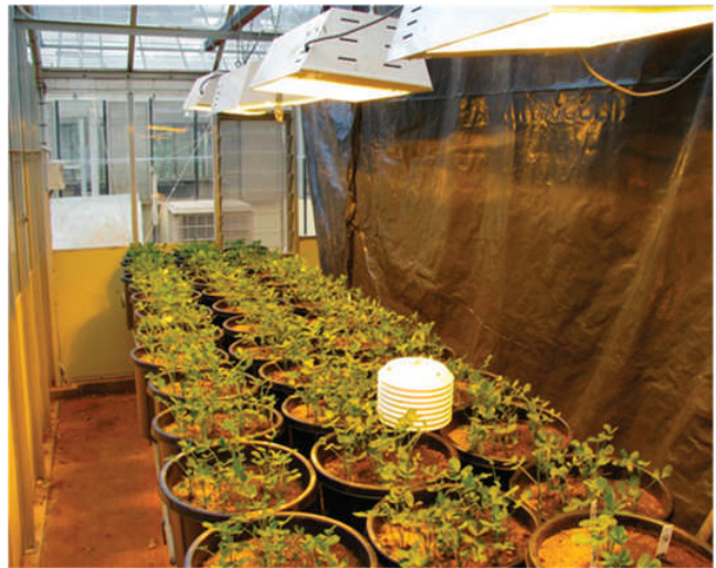
Fig. 1. F 2 plants growing in the greenhouse under controlled environment conditions at 15 days after sowing.

The F 3 generation was planted on 7 Aug. 2010. Due to a number of plants not producing viable F 3 seed, only 270 F 3 seeds were sown, in addition to 10 parental checks. A plant population of 10 plants per pot was again used with additional seed planted, where available, to account for emergence losses. Seeds were assigned randomly throughout the pots with all seeds labeled to ensure subsequent generations could be traced back to the individual F 2 line. Twenty-eight 30 cm 'Anova' pots were used with the same potting media, nutrition, watering regime and continuous light set-up as used for the F 2 generation. Gas fired heaters were in use at planting time until the end of September due to cool temperatures experienced during this period. Seedlings were thinned to the required population at 20 DAS. All pots were rotated on a weekly schedule to minimise the effects of shading during the growth period. The harvesting of the F 3 generation occurred on schedule at 89 DAS. All 28 pots were harvested and plant, pod and kernel characteristics were measured as for the F 2 generation experiment.